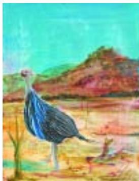
Untitled 50cm x 14cm