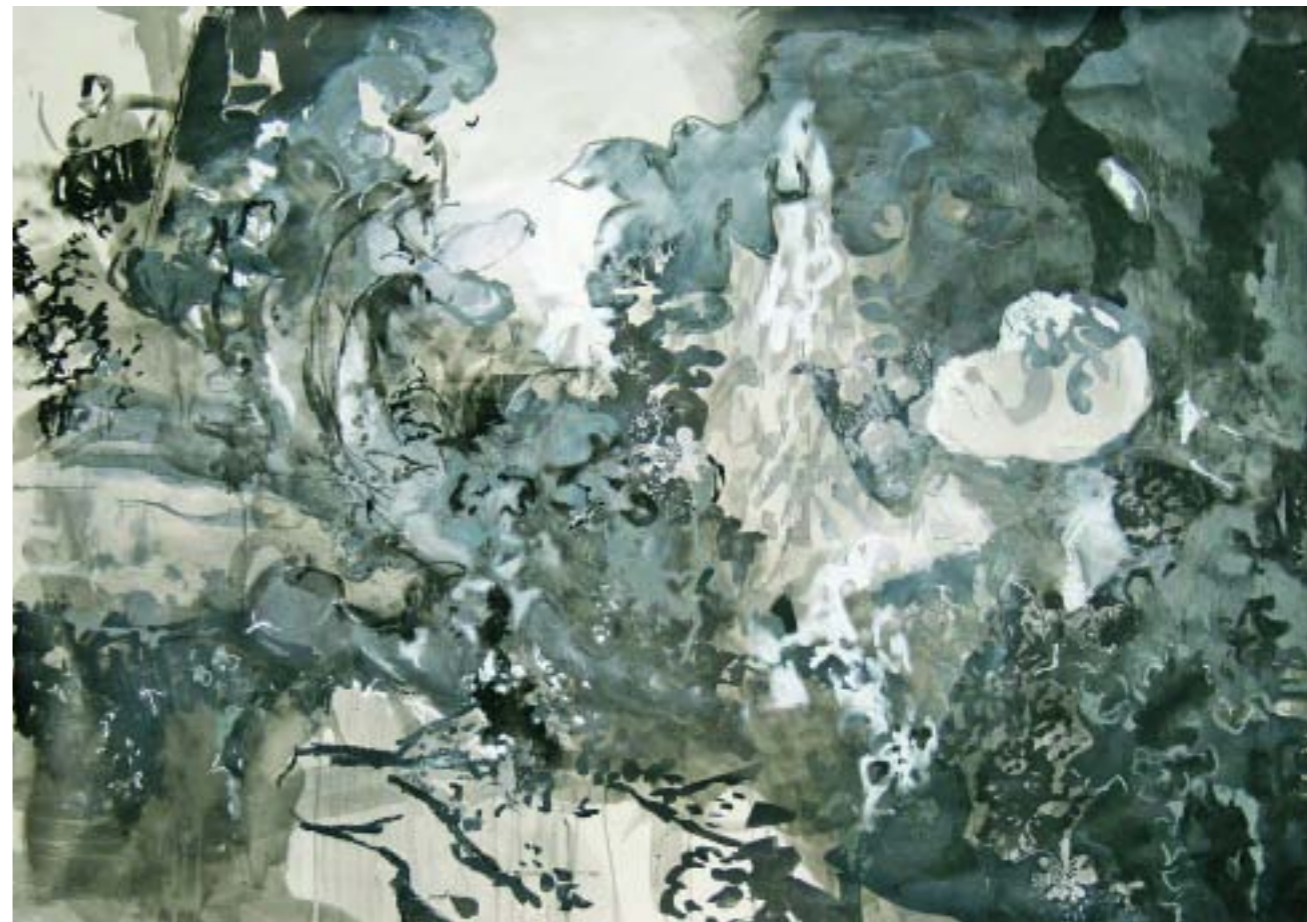
Phosphoresce Mixed media on paper 102cm x 137cm