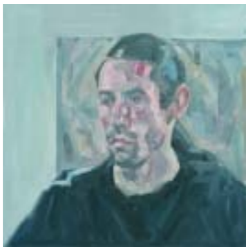
Christopher Oil on canvas 60cm x 60cm