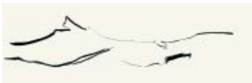
▶ Untitled Charcoal 59cm x 70cm