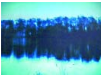
Lowlands Storm No1 Acrylic, oil and varnish on paper 105cm x 151cm