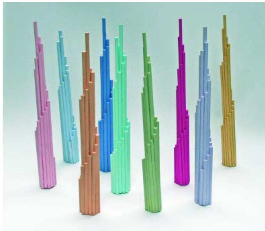
◀ Singularity (Maquette) Mixed media 21.5cm (8.5in)