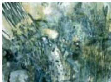
Cutch Mixed media on paper 102cm x 137cm