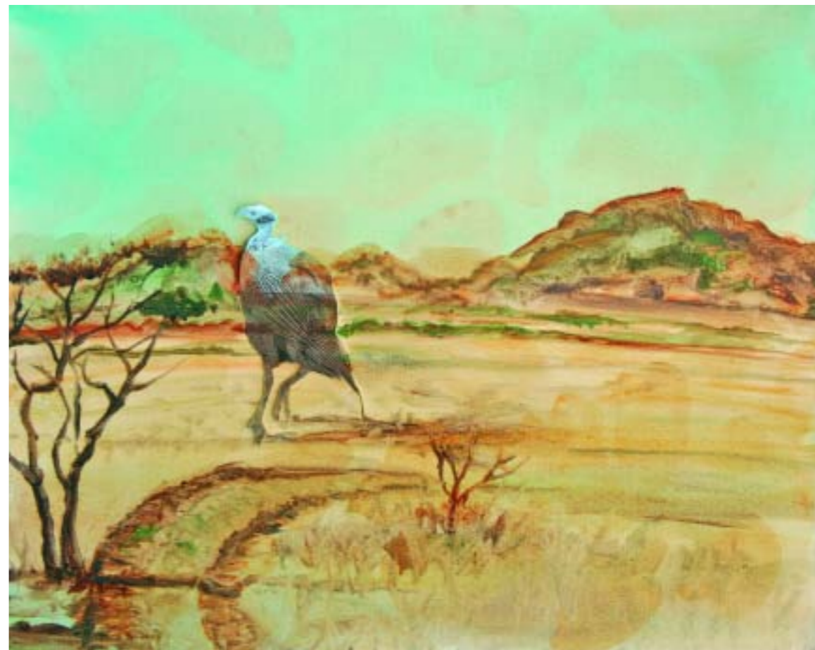
Untitled 30cm x 23cm