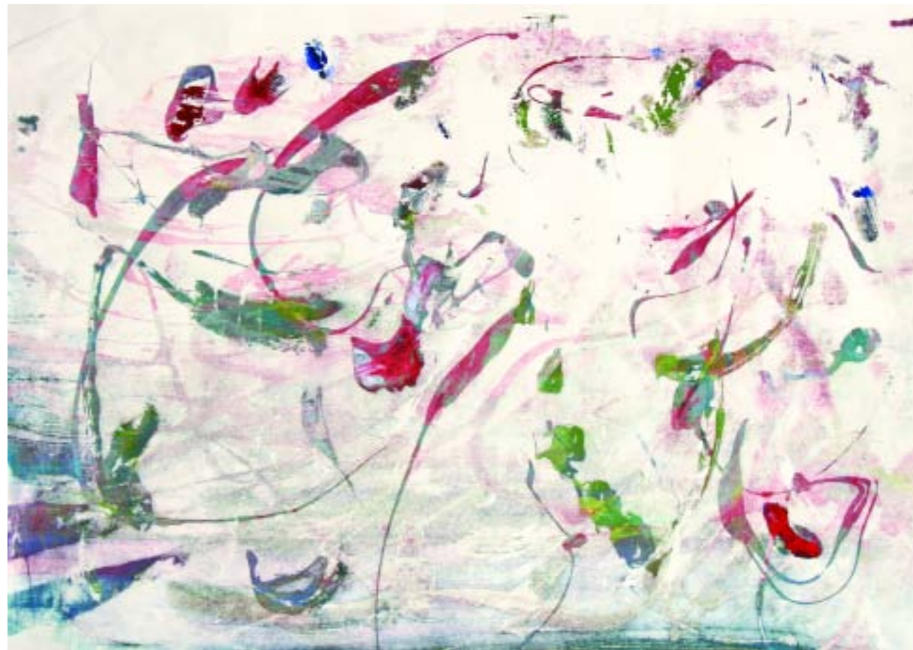
Untitled Acrylic on paper 74cm x 52cm