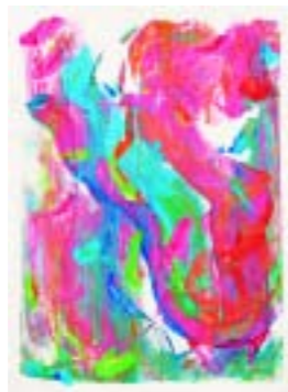
Untitled Acrylic on paper 59cm x 84cm