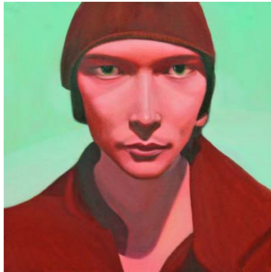
Fashion model Oil on canvas 61cm x 61cm